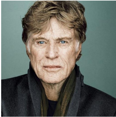
Hollywood actor Robert Redford (OBJ Redford)