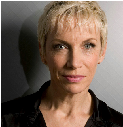
Annie Lennox of the Eurythmics (OBJ Eurythmics)

Added to this are certain others that might be uniquely British, where there is a different explanation. See, e.g., JPEL 409 OBJ Muriel Avenue, 258 JPEL 598 OBJ Fat Boy, 259 JPEL 621 OBJ Groton, 260 JPEL 625 OBJ Bowie, 261 JPEL 649 OP Potts, 262 and (in the case of Eire) JPEL 630 OBJ Munster. 263